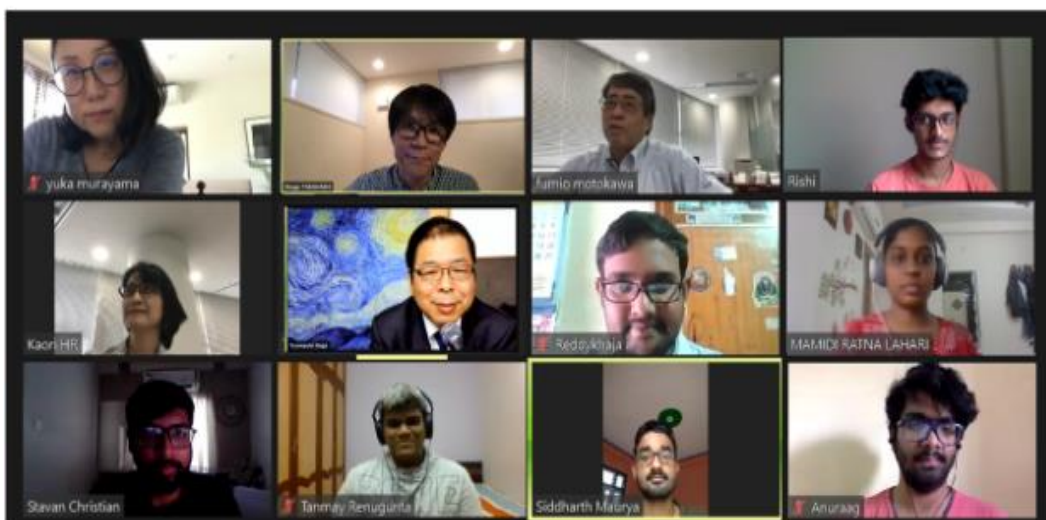
IITH Students during an Online Session

COVID-19 also influenced the arrival of recruited students in Japan. They are still forced to stay in India, however, during this time of patience, they are studying Japanese and IT for the future and are waiting for the day to work in Japan. This situation was taken up by JETRO news global eye (https://youtu.be/J64npf6Lxyc/) .