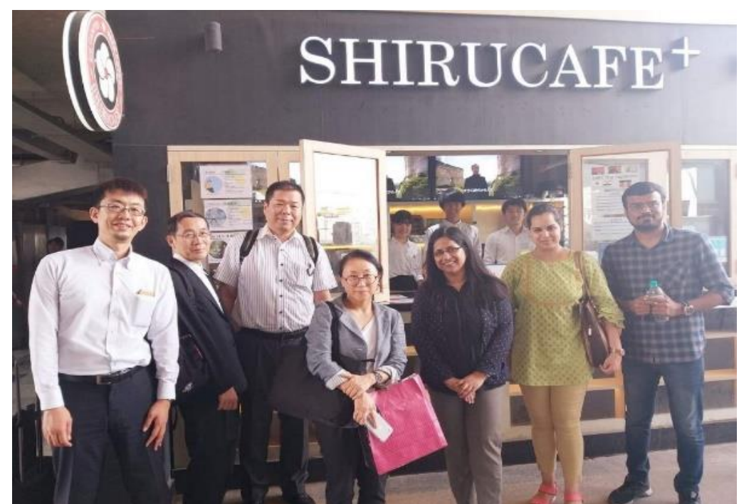
Visit to Shirucafe

https://www.jica.go.jp/india/english/office/topics/press191030.html