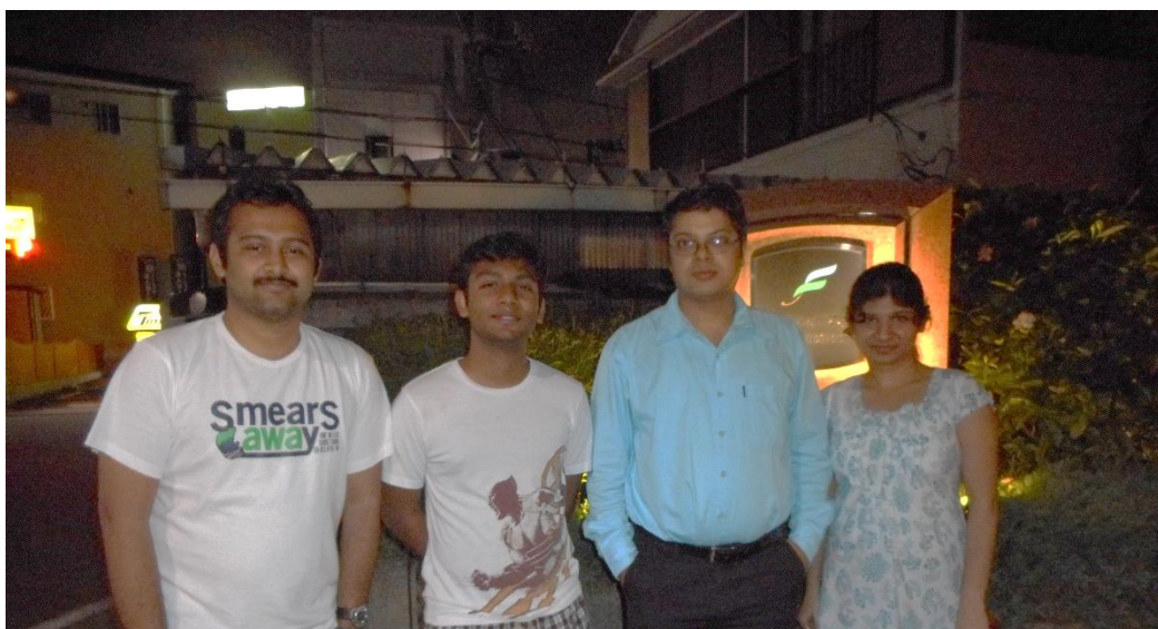
Figure 5: With IITH alumni working in Tokyo during Japan visit.