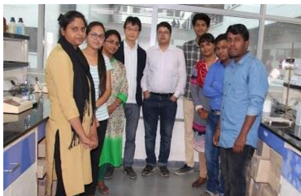
Figure 2: Prof. Hayato Tsurugi visited our lab @ IIT Hyderabad 2019