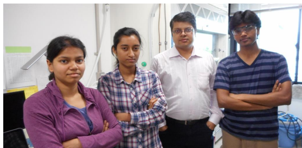
Figure 4: Several IITH master students working in Japan.