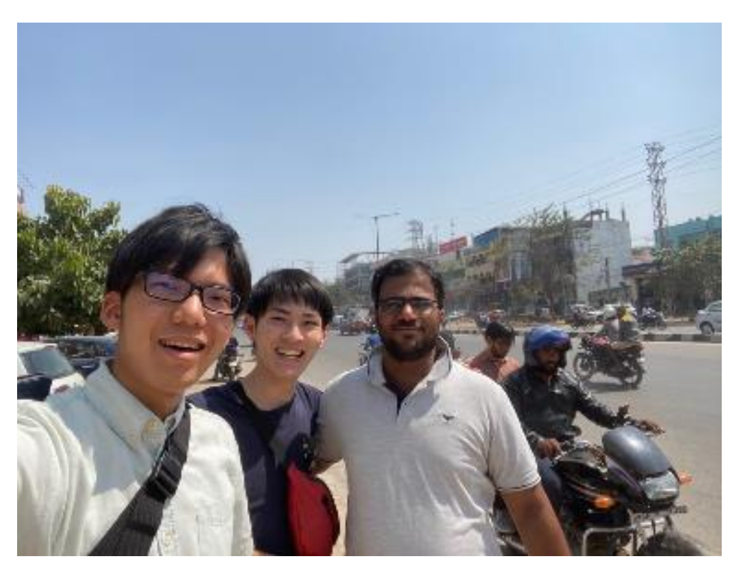
Exploring Hyderabad with IITH's friends

Hope for you and your family happiness and great health as well.