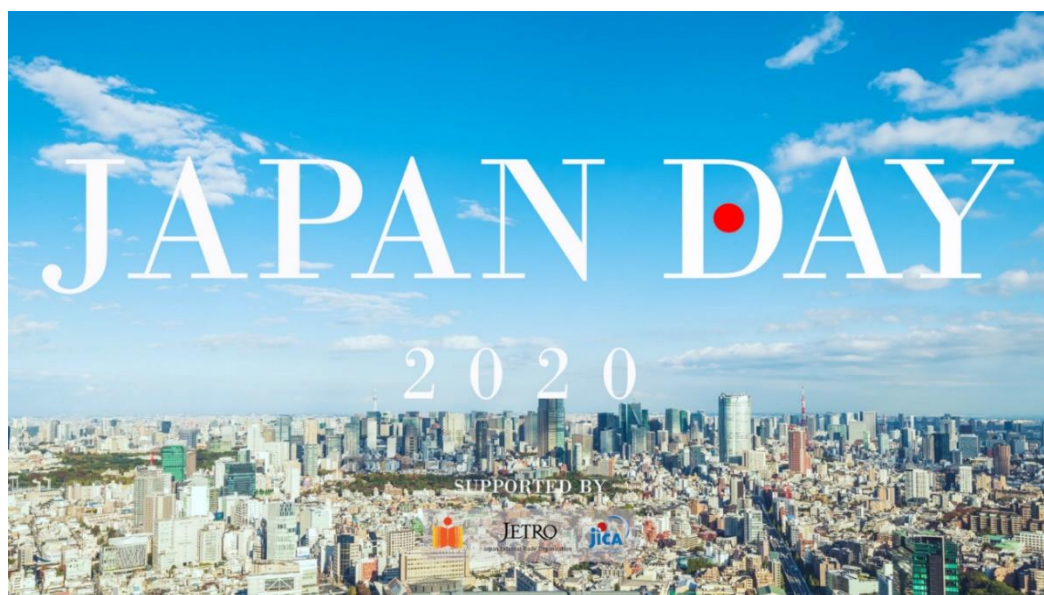
Japan Day Poster released by JETRO