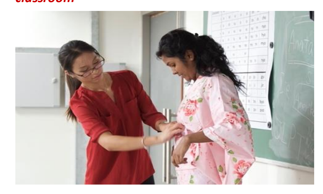
Japanese traditional dress (yukata) hands-on session in the classroom

Also, we have designed and deployed a Moodle-based Learning Management System, "ORP Gym" to support their self-study outside classroom hours and complement classroom activities since 2018. The name of the system came from the fitness gym and students can many voluntarily practice with quizzes automatic and manual feedback from language instructors on the system whenever they have time. One of the features of the courses encourages them to use practically what they learn as many times as they want using the system, not just input the knowledge. The process of making mistakes and repairing them through retries are similar to our real daily life. "Failure teaches success" ("Shippai wa seikou no moto" in Japanese proverb). Mistakes teach us a lot.