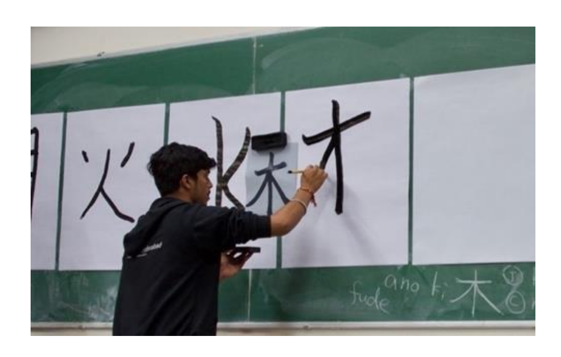
Japanese Calligraphy hands-on session in the classroom

Although learning Japanese as a Second and Foreign Language (SFL) requires a huge amount of time and effort, we believe the combination of face-to-face interactions during classroom hours and voluntary self-study outside classroom hours are very helpful in enhancing the learning effect. Several culture hands-on sessions such as calligraphy and traditional dress are introduced during classroom hours (as shown in following figures).