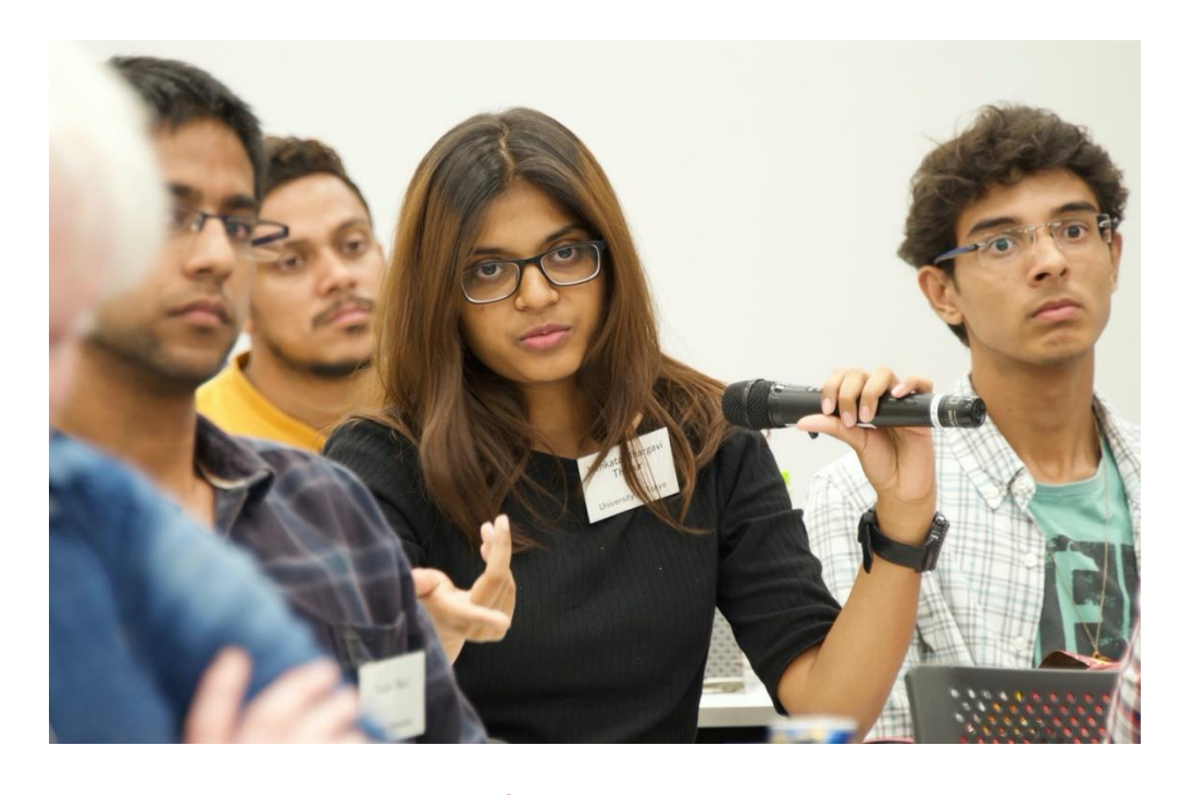
IITH Alumni in Japan

The change makers and accelerators of Indo-Japan collaboration were the students and fresh alumni of IITH, who went to Japan for internship and higher study in Japanese companies and universities. They always and naturally help to establish the high reputation of IITH both as the ambassadors to Japan and the hard evidence of many positive aspects of the academics, R&D and culture of IIT Hyderabad.