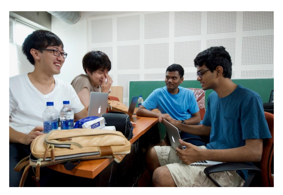
UoT-IITH Workshop in IITH