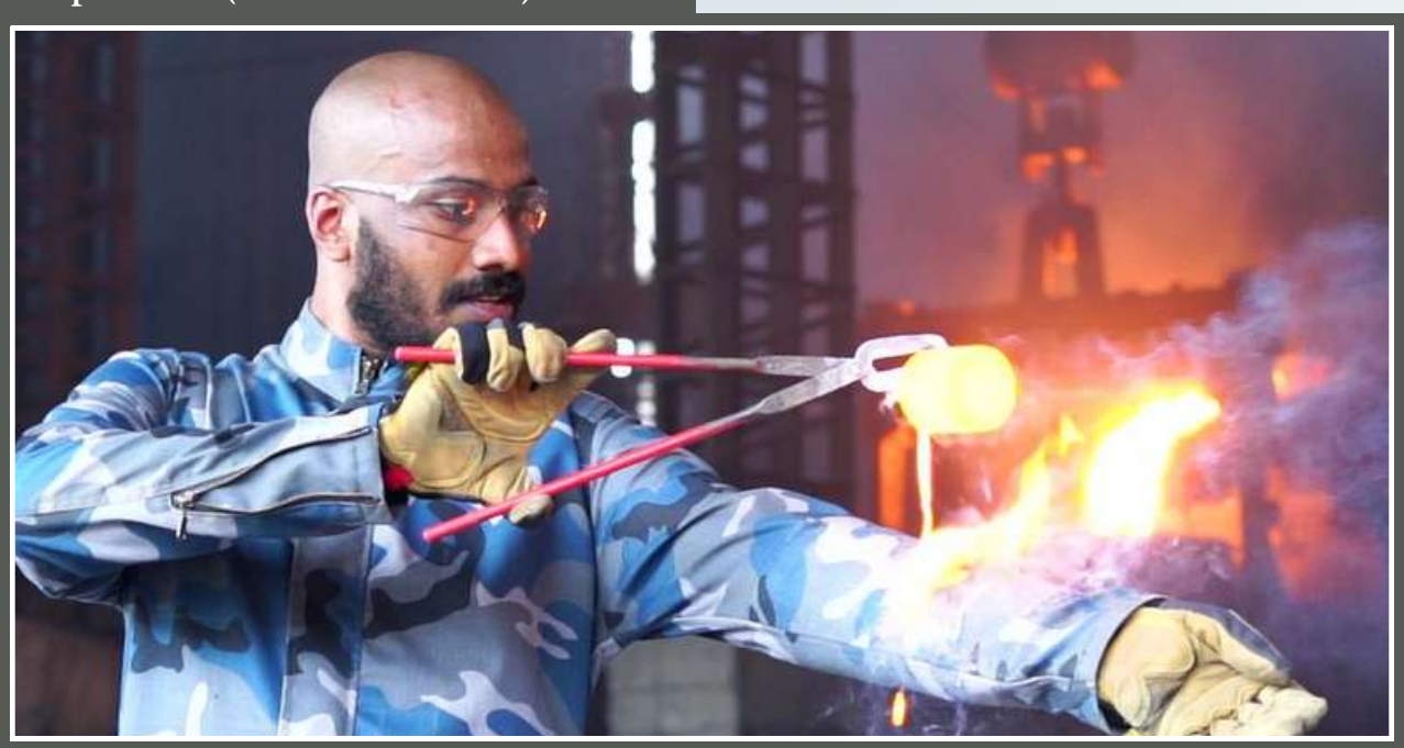
IITH | Volume 6 | Issue 1 | Jan - Mar 2024 | Defence @IITH | 09